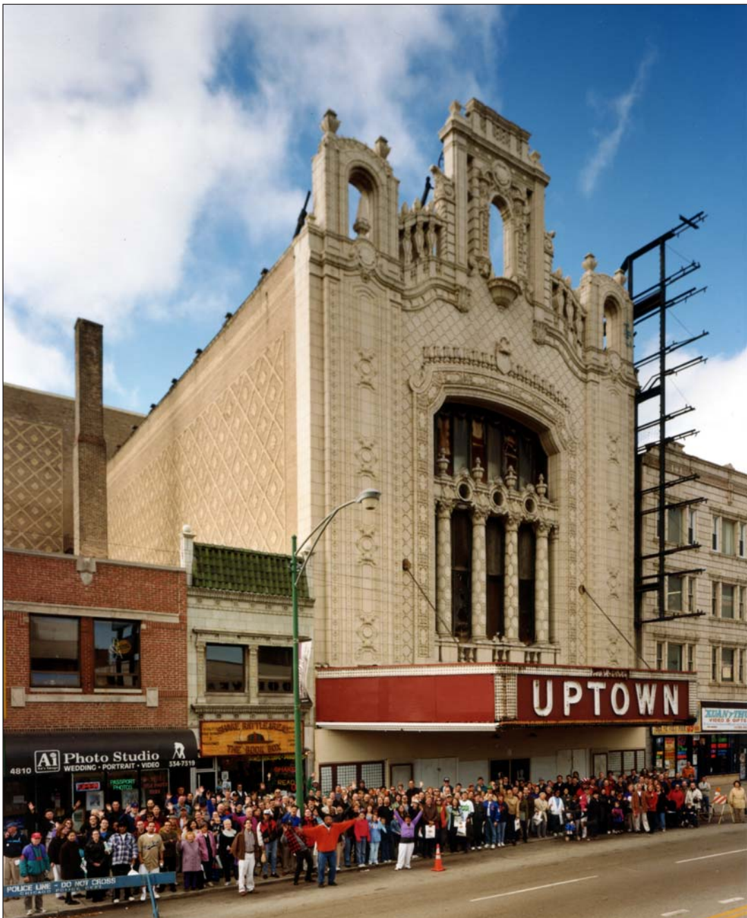
'Uptown Community Portrait 2000' courtesy of Friends of the Uptown